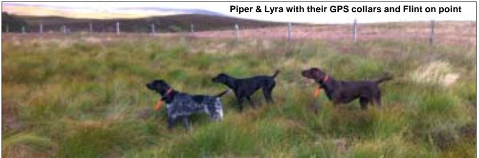
Piper & Lyra with their GPS collars and Flint on point

Lunch was taken in a shepherds hut which afforded the time for totalling the morning's count, which caused considerable consternation, possibly due to the tots of whisky that were sampled.